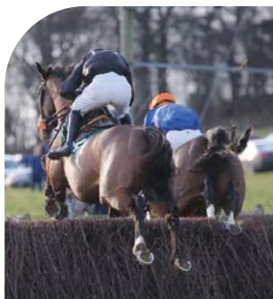
Amateur and Point-to-Point Jockeys