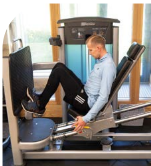
Flat Jockeys (including Apprentices)