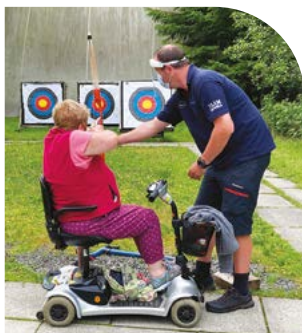
Jockey's Family (Spouse, partner, child or dependant)