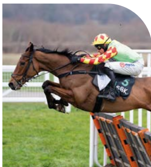
National Hunt Jockeys (including Conditionals)